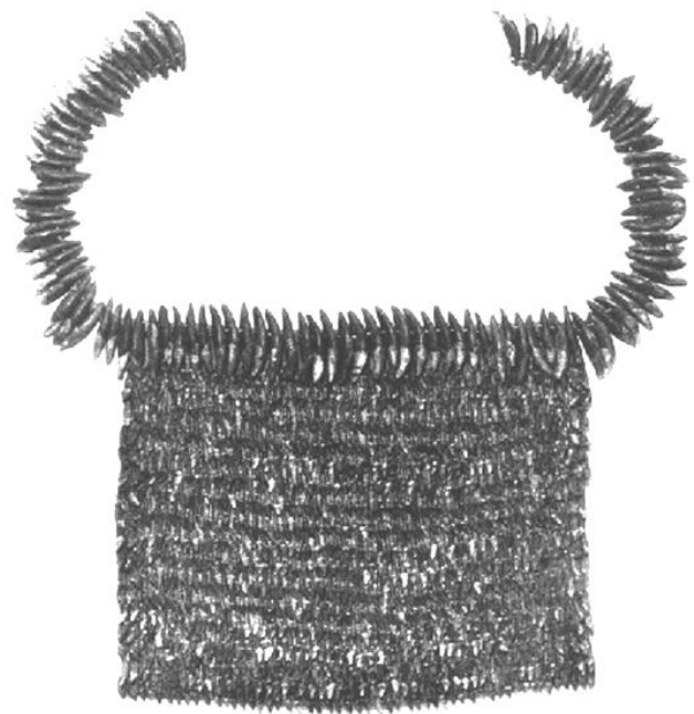
Figure 10. Dog tooth "apron" or loincloth from Grave 1, Sitio Conte, Panama (image from Lathrop 1937, Smithsonian Institution, Washington, D.C. [public domain]).

postcranial remains of small, powerful, terrier-sized dogs from the Seaview site in Barbuda provide further insight into the skeletal measurements and nature of the dogs in the Caribbean region (McGovern 2008). Overall, skeletal remains of prehistoric dogs in the Circum-Caribbean indicate that the medium-sized dog was the most common or most geographically widespread. The sizes of the prehistoric dogs of the Caribbean can be compared to those in mainland North and South America, such as in Virginia, Mexico, Argentina, etc.