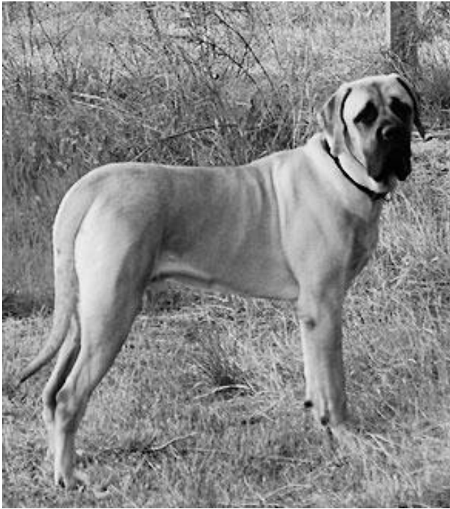
Figure 1. A modern mastiff-type dog showing the massive build, often brindle coloration, and black muzzle often associated with mastiffs.

South America (Allen 1920, Gallardo 1965, Weiss 1970), thus it can be speculated that more than one type or “breed” of dog was present in the Greater Caribbean (Saunders 2005). (Note: The use of the word “breed” here is used in a general sense and not in the technical sense as in the “breeds” recognized by the American Kennel Club.) It is through the accounts left by Christopher Columbus in his Diario (1989 [1492]:95) that there is an indication there were at least two types of dogs in the Bahamas based on his 17 October 1492 observations on Fernandina: “mastiffs” ( mastines ) (Figure 1) and “terriers” ( branchetes ) (Figure 2).