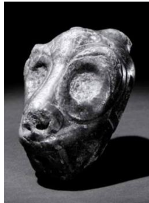
Figure 6. Steatite dog effigy head (nasal snuffing device?) from Barbuda (Taíno, A.D. 700-1500), 14.7 cm high (from http://www.kislakfoundation.org/pc_html/wi5.html ). © Justin Kerr.

Depictions of begging or submissive dogs have been carved or molded in semiprecious stone and precious metals such as the gold curly-tailed dog from Guapiles, Costa Rica (ca. A.D. 400-900), the curly tailed dog pendant in agate from the Azuero Peninsula, Panama (ca. A.D. 400-900), and the Tairona tumbaga (gold/copper/silver alloy) pendant of a stretching, submissive, or play-begging dog from the Santa Marta region of northern Colombia (Figure 8) (A.D. 1200-1500).