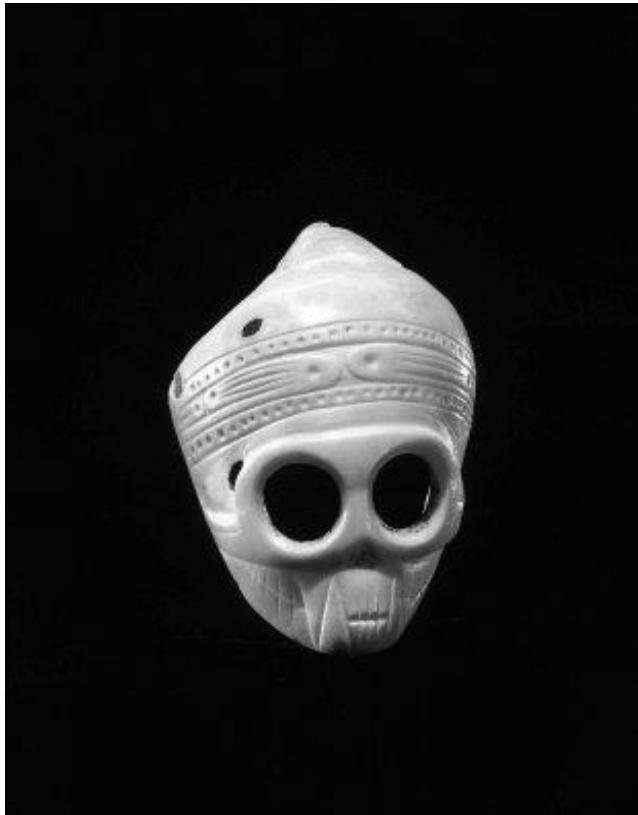
Figure 9. Shell maskette of Taíno canine god, Antigua (A.D. 500-1500), carved Strombus shell, ht. 7.5 cm (3").

dogs (n=22) from a single site in the Caribbean, from Sorcé, Puerto Rico, indicated the presence of a medium-sized dog, relatively uniform in size (Wing 1991), and similar to the Taíno aon or Mesoamerican techichi . Based on colonial documents and early explorers' accounts, these dogs were of various coat colors and hair textures. The mean height of the Sorcé dogs was 42.7 cm at the withers (shoulder height), mean weight was 9.26-9.74 kg (about 20.4-21.4 lbs), and a number of interesting dental abnormalities were present (Wing 1991). For example, the first lower premolar (P 1 ) appears to have been congenitally missing in 64% of the dogs, the third lower molar (M 3 )