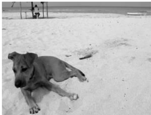
Figure 2. A modern terrier-type dog on the beach. Today, this dog is sometimes referred to as perro jíbaro (“wild dog”) or feral dog on islands such as Cuba and Puerto Rico.

The characteristic of barklessness is described in a number of dogs that appeared in the Caribbean area and other parts of the Americas and appears in numerous firsthand accounts. Christopher Columbus recorded the presence of barkless dogs on his exploration of Cuba. For example, dogs observed on 27 and 29 October 1492 were said to have included “dog[s] that never barked” ( perro[s] q nūca ladro ); on another occasion, 6 November 1492, Columbus recorded, “Four-footed beasts they did not see, except dogs that did not bark” ( perros q no ladravā ) (Columbus 1989 [1492]: 117, 121). The Taíno word