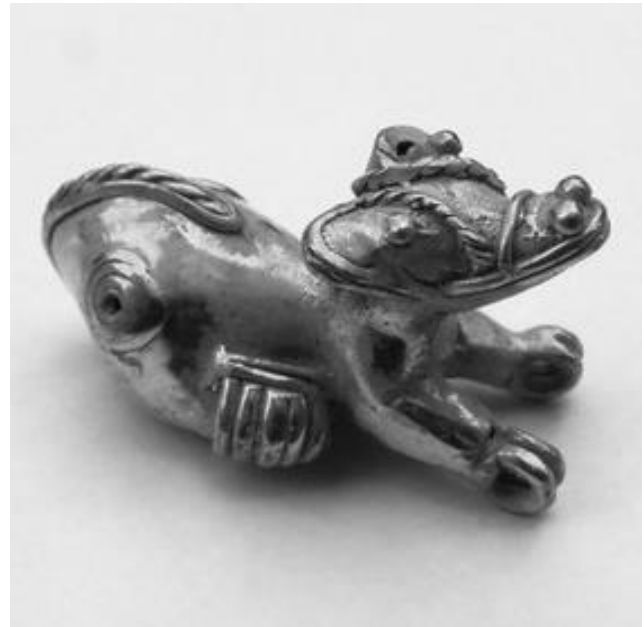
Figure 8. Tairona canine pendant of a stretching or play-begging dog (?) with upturned tail, tumbaga (gold/copper/silver alloy), A.D. 1200-1500, Santa Marta region, northern Colombia.

Carib, Cuna, and Cuneo, etc. cultures of Panama and northern South America suggest that the dog tooth necklace was important until historic and recent times. Figure 11 illustrates the locations of prehistoric dogs in ethnographic accounts, cave art, pottery, stone, wood, bone, teeth, metal, and skeletal remains throughout the Circum-Caribbean region, Central and northern South America.