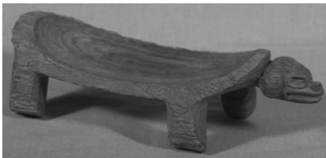
Figure 5. Duho (ceremonial seat), or snuff platter, in shape of a dog (?), lignum vitae , Hispaniola (Taíno, A.D. 1000-1500) (from http://www.loc.gov/exhibits/kislak/images/kc0020s.jpg ).