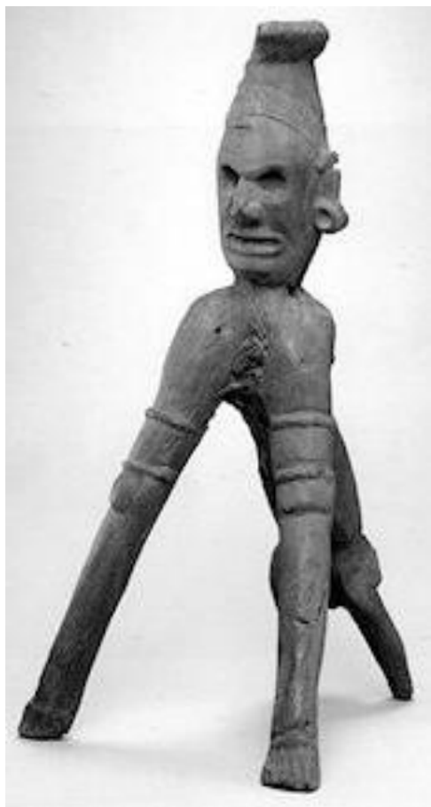
Figure 12. Canine idol, wood, Taíno, A.D. 1000-1500, Santo Domingo, Dominican Republic.