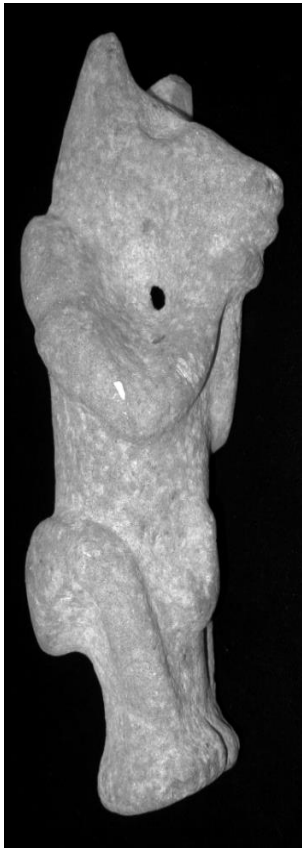
Figure 7. Stone carving of the dog spirit, Opiyé-Guaobirán , Haiti, Taíno culture. Image courtesy of Division of Anthropology, Cat. No. ANT. 237499. ©2013 Peabody Museum of Natural History, Yale University, New Haven, CT. Used with written permission. Note the ithyphallic state.

Caribbean and perhaps from as far away as mainland South America. It is known that dogs in northern South America were commonly traded from owner to owner across expansive geographical territories (Gallardo 1965, Schwartz 1997). Dogs in South America were also traded for other goods such as metal, beads and perhaps cloth (Acosta et al. 2011, Allen 1920, Prates et al. 2010). Based on bone strontium analyses of dog teeth found on several Caribbean islands, it is now clear that dogs and dog teeth were traded around the Caribbean via regional and long distance trade (Hofman et al. 2011, Laffoon et al. 2013). Ethnographically recovered dog tooth necklaces housed in the Peabody Museum at Harvard from the