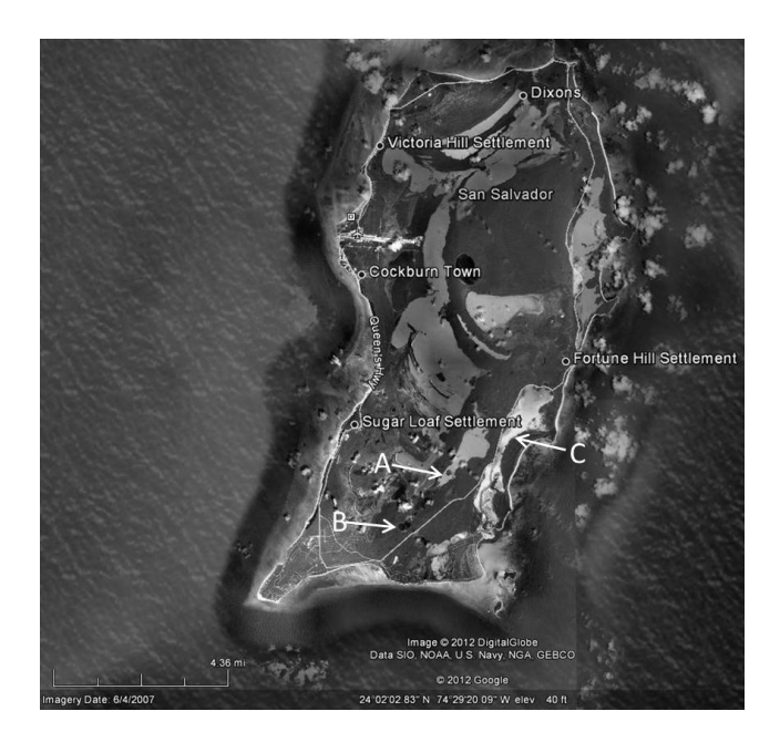
Figure 1. Leaf collection sites on San Salvador (A: Stouts Lake, B: Mermaid Pond, C: Pigeon Creek).

Leaves were collected from red mangroves at the south end of Stouts Lake and Mermaid Pond (Fig. 1 – sites A and B respectively), and the north side of Pigeon Creek (Fig. 1 – site C) in June of 2010. Care was taken to avoid collecting leaves from consanguineous individuals by collecting from spatially separated large trees that were generally more than 3 meters apart. The leaves were placed in plastic bags and transported to the Gerace Lab where they were refrigerated until transport to Florida Gulf Coast University. Leaves were then stored at -80° C until extraction of DNA.